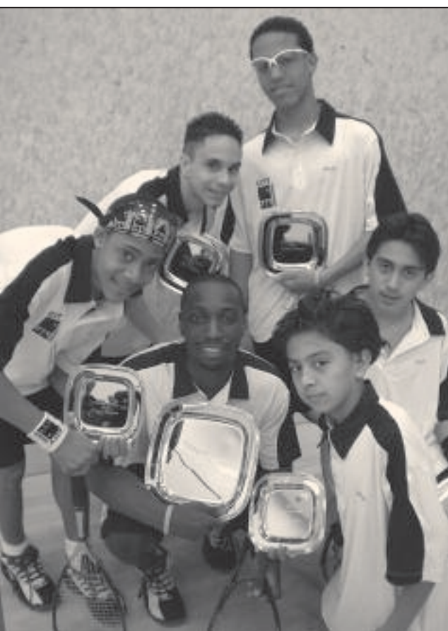
CitySquash's U15 Boys Team won the Urban National title at the SquashBusters Youth Center in Boston.